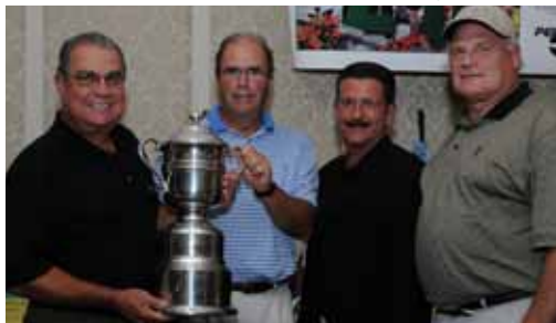
Defending 2009 Champions: RPAQ-4